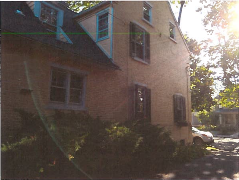
View from middle front of house looking towards front