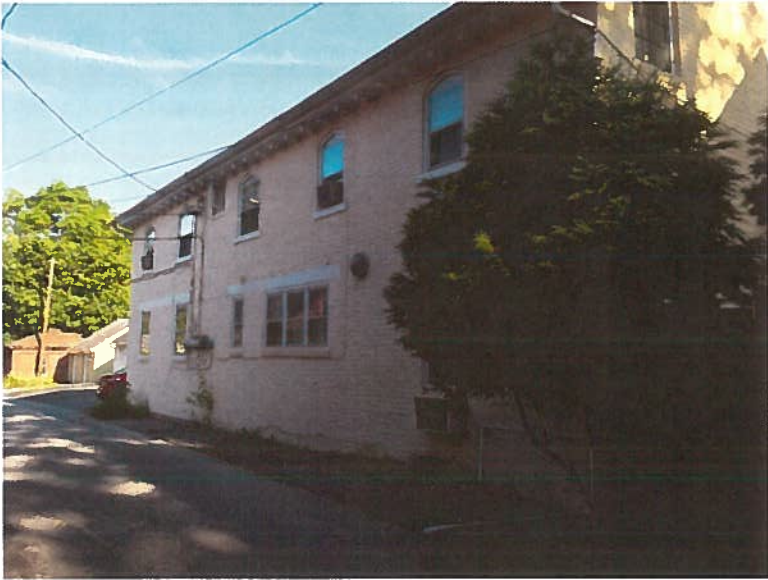
View from middle of house looking towards rear